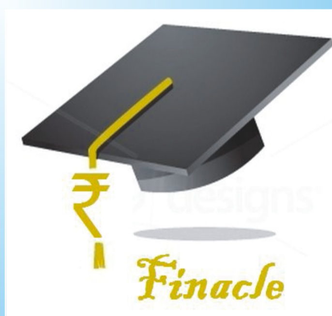
Th new logo of "Finacle"