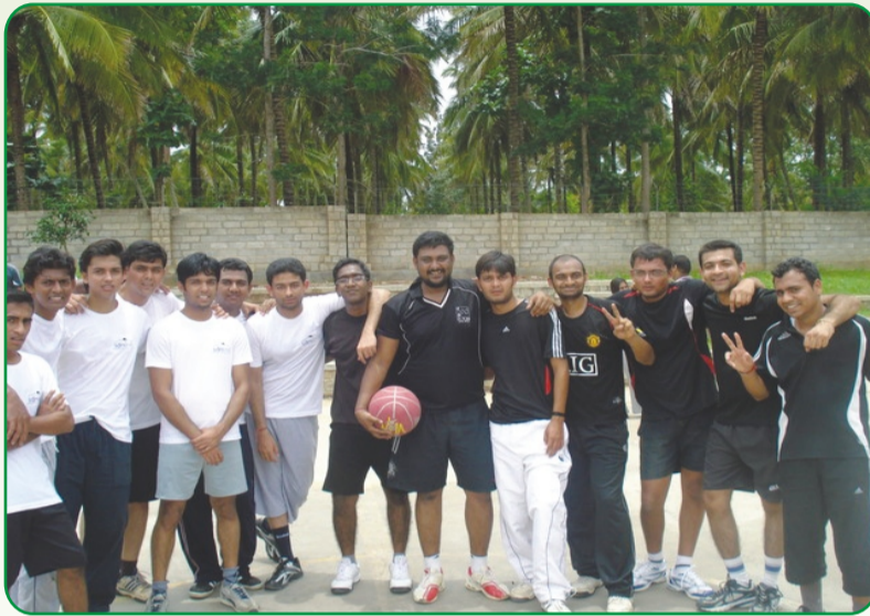
Team games on sports day