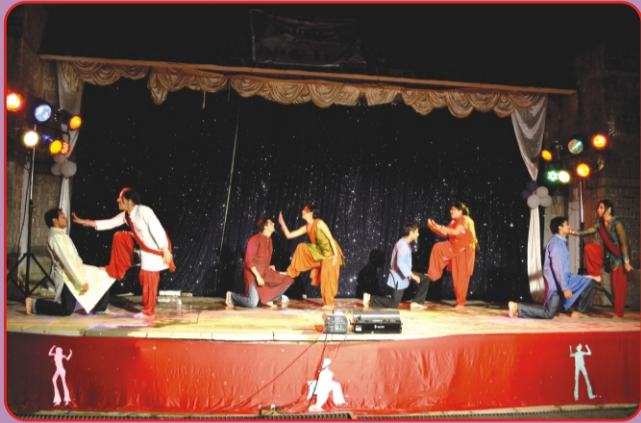
Dancing to the beats on Khoj night