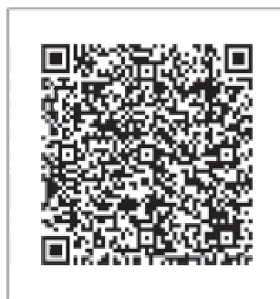
Figure 1: Sample image of QR Code

Quick Response (QR) code or “2D” barcode that can be read by downloadable smart phone readers with camera-scanning capabilities was introduced in Japan in the year 1994. A subsidiary of Toyota Inc - Denso-Wave Inc (Eby, 2012), an auto parts maker used the QR code to tag its manufactured auto parts. QR code is similar to barcode; but QR code is better than barcode for the simple reason that it can include text and numeric as opposed to only numeric in barcode. The QR code has the encoded text, numeric and other characters in the form of pixels. A typical QR code (Lyne, 2009 ) looks like Figure 1 .