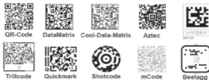
Figure 6: Competitors and Variations of QR Codes

As with any technology there will be winners and losers. There are many alternatives to QR codes in the marketplace that may become the losers in this space, if QR emerges as the leading barcode technology standard. Figure 6 provides a side-by-side comparison of some of the competitors and variations of QR codes.