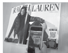
Ad in Magazine