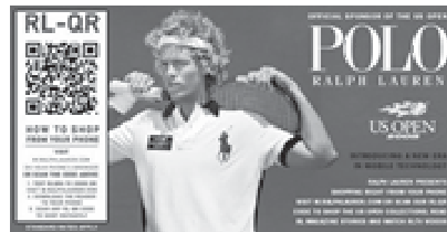
Event & Product Promotion