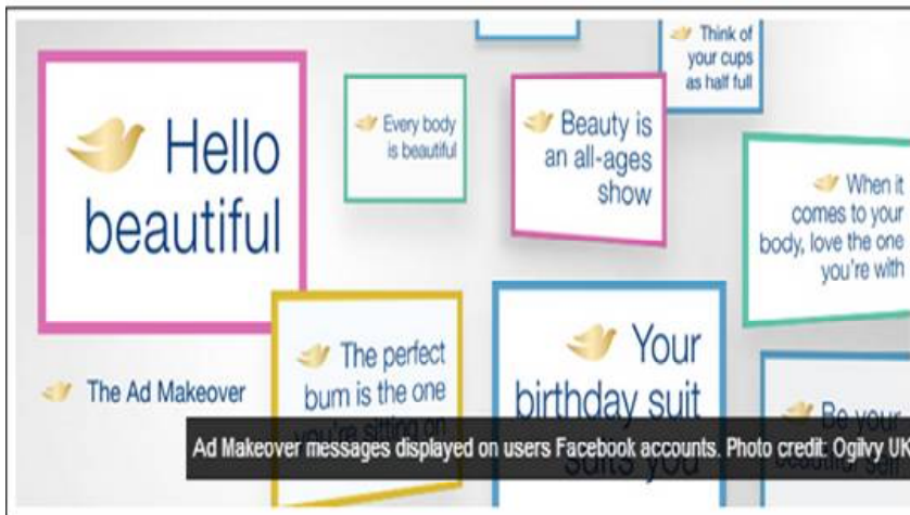
Exhibit 3 : Dove - Facebook Page