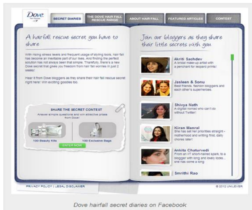
Dove hairfall secret diaries on Facebook