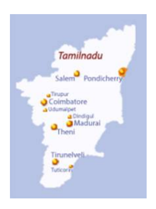
Exhibit 2: Income and Expense Statement of AECS