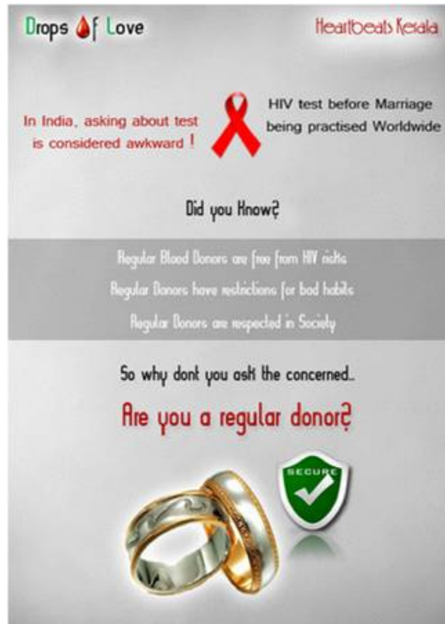
Figure 2 :A VBD promotion poster

A Google form has been created and is shared in all Facebook pages. Any visit to the pages due the promotion and viral marketing will give an option for the visitors to join as a regular donor. In addition, KIOSKS and posters were set up in different promotion camps which contained logos and details of new facebook pages.