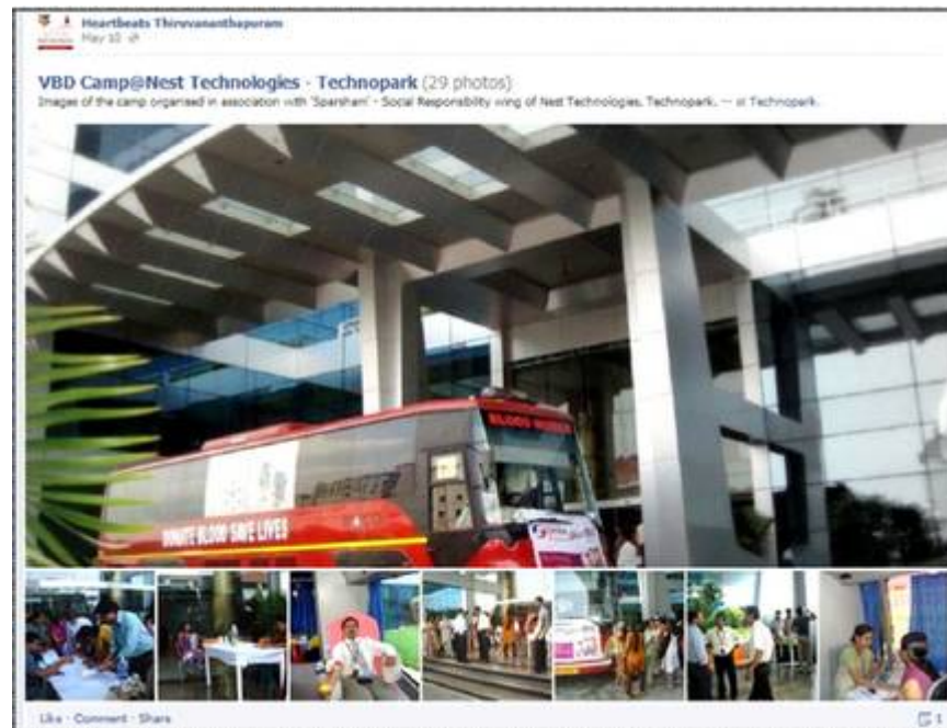
Figure 3 : DOLF Facebook page

Students from each of the 400+ colleges were contacted through phone and mail, promotions through KIOSKS and posters done during visit of Red Ribbon Express in Kerala and during Youth camps undertaken by organization.