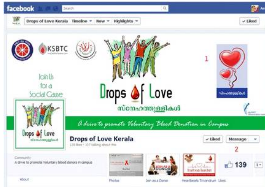
Figure 4 :A Camp album in page