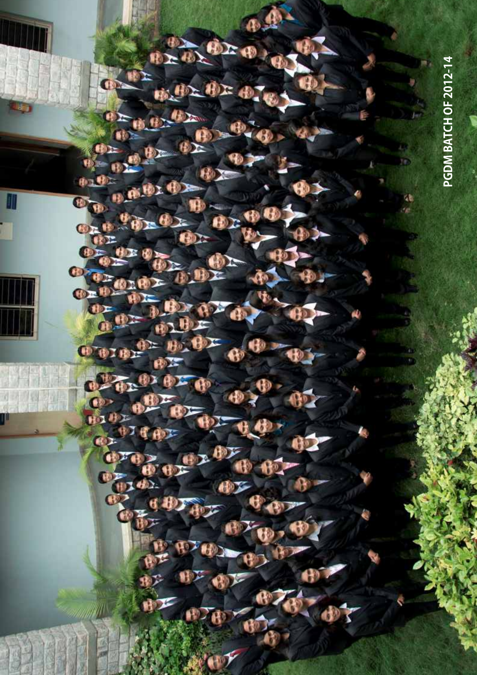
PGDM BATCH OF 2012-14