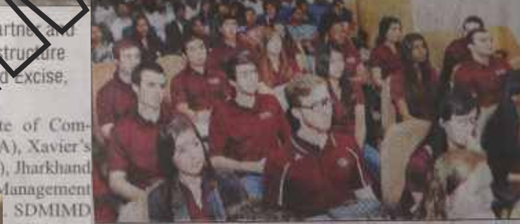
FOREIGN GUESTS: Students from Maya Business School (as) attend a symposium at SDM-IMD in Mysore on Monday.

SDMIMD students have secured top positions in the BRICS meet at Shanghai. The students were recognized for their academic excellence and leadership skills. The event was a significant milestone for the institution, showcasing the quality of its education and the capabilities of its students.