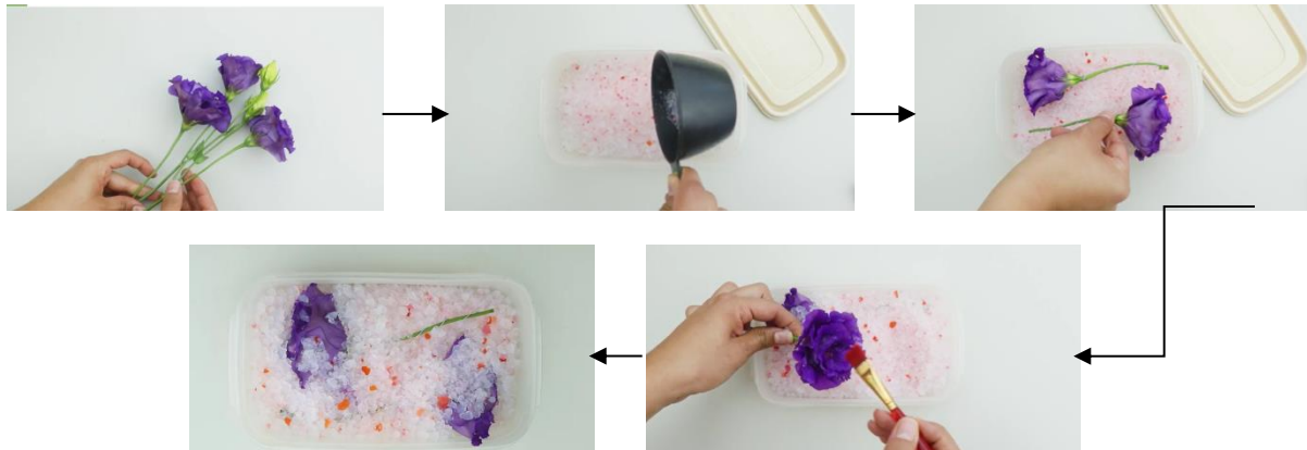
Fig. 1: Flow chart of Silica-gel drying technique

It is the method of dehydration of flowers by which the plant material is embedded in desiccant viz, silica gel for the dehydration of flowers. Plastic containers were used in a well-ventilated room, the plastic containers were poured with a two inch layer of a silica gel and it was gently pushed into the medium and was covered all around with a desiccant without disturbing the shape of the flowers. The plant materials used in embedding drying were the Gerbera flowers, Bougainvillea, Chrysanthemum, Roses and Marigold. After embedding the flowers with desiccants the containers were kept at optimum room temperature.