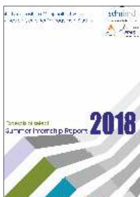
Excerpts of Summer Internship Projects