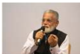
Dr. K Radhakrishnan Former Chairman of Indian Space Research Organization (ISRO) and Former Chairman, Indian Space Commission Date: July 19, 2019