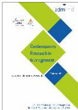
Contemporary Research in Management