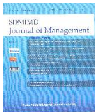
SDMIMD Journal of Management