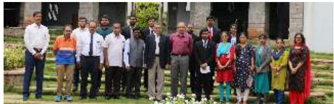
A Pre-Conference Workshop on Empirical Research in Finance was organized on September 5, 2019, for the researchers and faculty members in the area of finance and accounts .