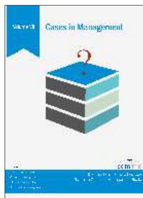
Cases in Management