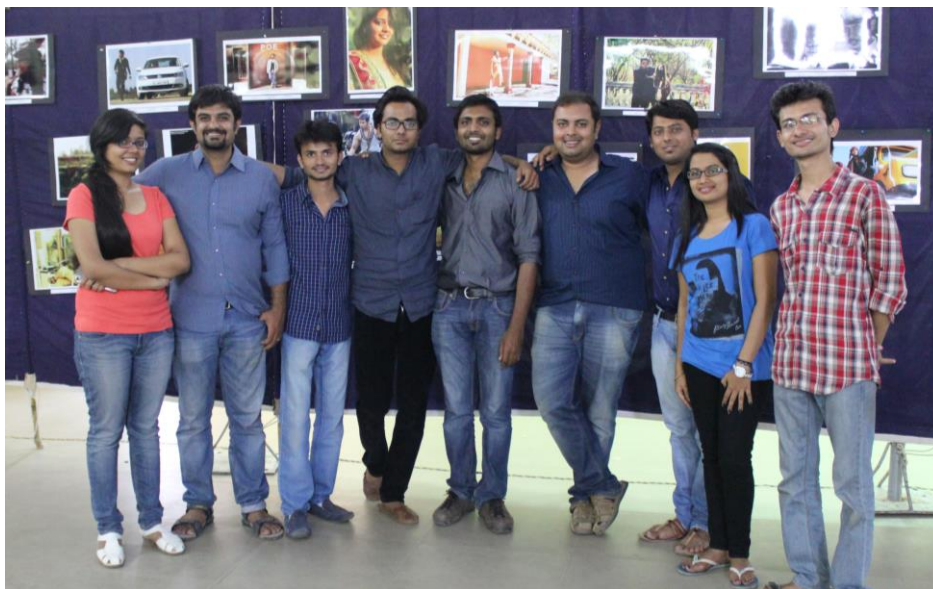
Members of 25th Day Production Unit of SDM-IMD

These photographers have carved a niche for themselves and have found a fan-following among the student fraternity. Whenever somebody sees these photographs, they will remember the college, the places they visited, their friends and others.