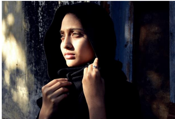
A photograph by Himanshu Singh Gurjar

( http://www.starofmysore.com/main.asp?type=specialnews )