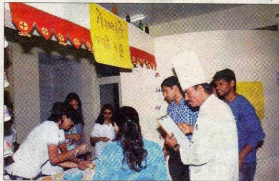
Judges were seen keenly listening to young, amateur chefs at SDMIMD food carnival 2014